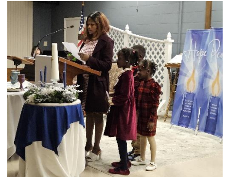
Christmas Eve Candlelight Service was held in the Fellowship Hall at 5:45 pm.