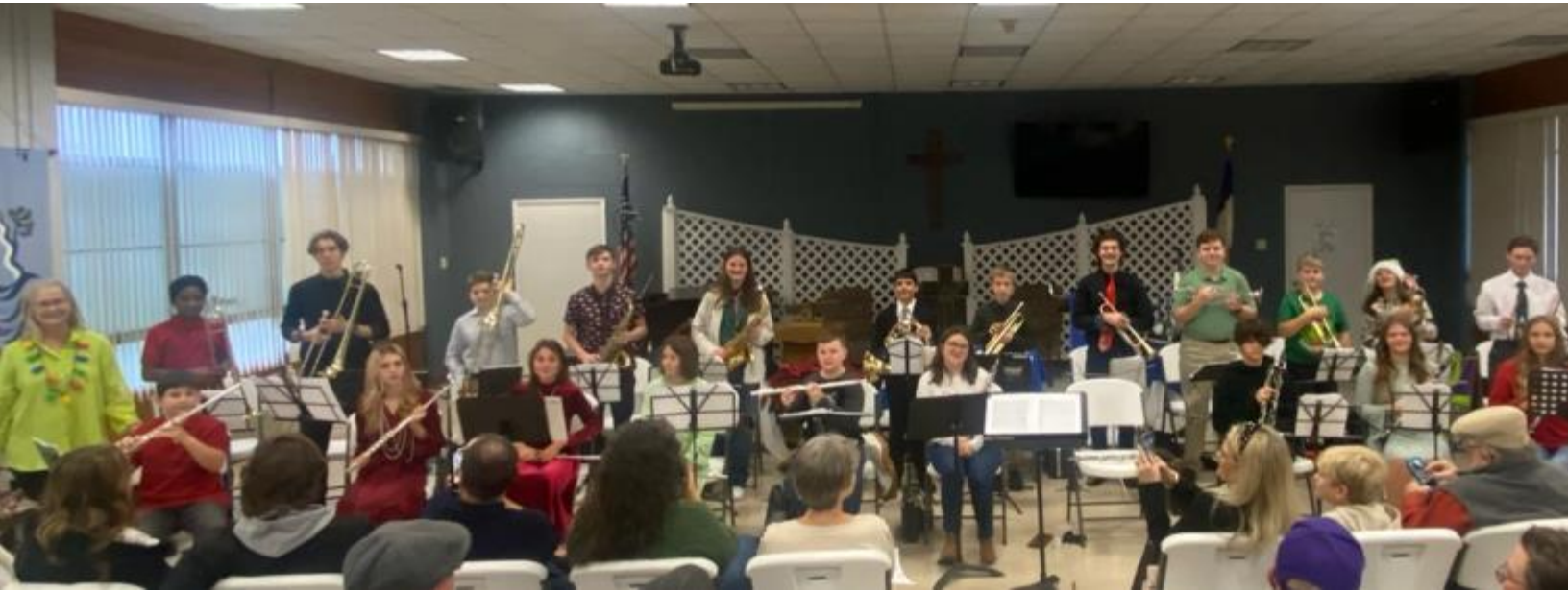
(St. Andrew Presbyterian Church hosted the Homeschool Music and Band Recital on December 7th)